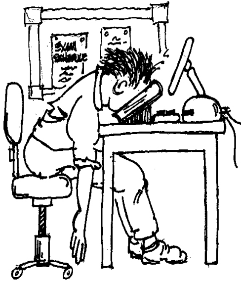
I feel like this every night with Digi Logic HW...

Black out, but not from alcohol. Pretty sure if the smell booze on your breath/clothing you're just SOL.